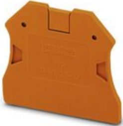
End cover, length: 47 mm, width: 2.2 mm, height: 39.8 mm, color: orange

Please be informed that the data shown in this PDF Document is generated from our Online Catalog. Please find the complete data in the user's documentation. Our General Terms of Use for Downloads are valid ( http://phoenixcontact.com/download )